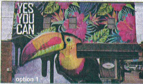
The tropical toucan is one design option local residents can vote on.

About three years ago, Carrillo became interested in mural painting.