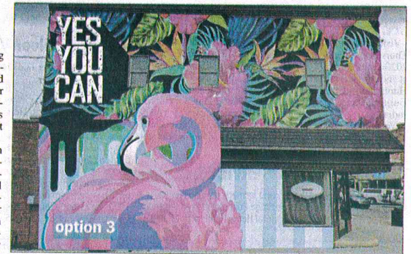
This flamingo is also an option to be voted on.

"I'm going to be setting up a meet for us to do. They can send it to me in an email. They can send it to me on social media. They could meet me while I'm outside painting and bring me their papers. On site, I'll have these pieces of paper to go, so if anybody walks past me and talks to me, I'm going to offer them the opportunity to do this. Obviously, not everyone can go out due to COVID-19. I want to make